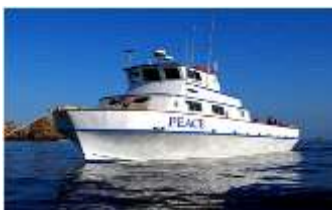
Peace Dive Boat

(Karim is at the same address—31316 Via Colinas, Westlake Village)