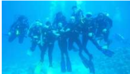
Diving in Taba, Egypt

Special Notes: If anyone has something to put into the newsletter, please send to the Newsletter at whalersdiveclub.com or you can email them to purplecoral200@gmail.com