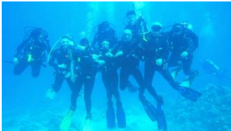
Diving in Taba, Egypt

Special Notes: If anyone has something to put into the newsletter, please send to the Newsletter at whalersdiveclub.com or you can email them to purplecoral200@gmail.com