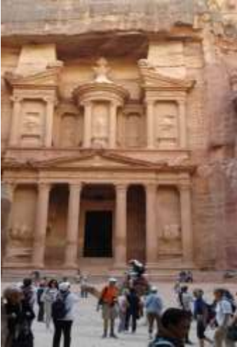
The Treasury at Petra and the Port of Jaffa at sunset