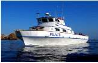
Peace Dive Boat