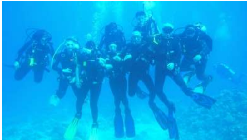
diving in Taba, Egypt