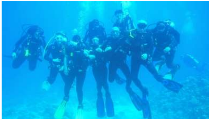
Diving in Taba, Egypt

Special Notes: If anyone has something to put into the newsletter, please send to the Newsletter at whalersdiveclub.com or you can email them to purplecoral200@gmail.com