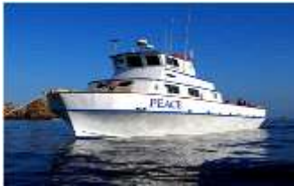
Peace Dive Boat

For more information please contact Glynn @ 310-266-2955 (Glynn now has a new address—31316 Via Colinas, Westlake Village)