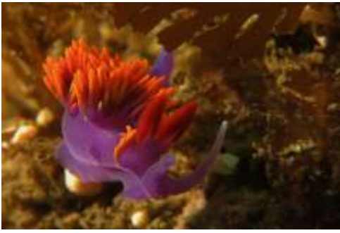
A Spanish Shawl nudibranch