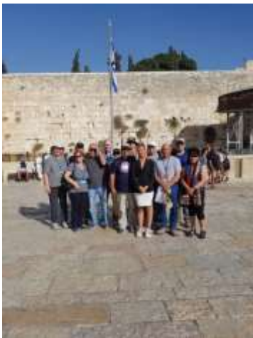
The whole gang at the Western Wall and diving in Taba