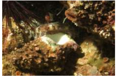
Two Spot Octopus in his lair