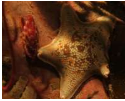
A Gastropod known as a Simnia