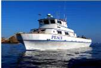
Peace Dive Boat

For more information please contact Glynn @ 310-266-2955