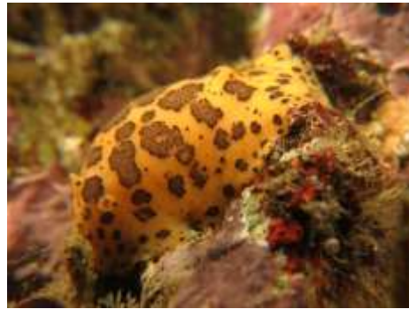
A Monterey Dorid, a nudibranch

at Santa Barbara Island