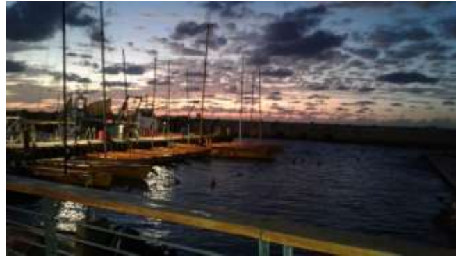
The Treasury at Petra and the Port of Jaffa at sunset