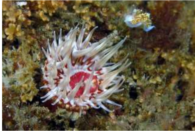
Fish eating Urticina w/ Hermisenda nudibranch in background