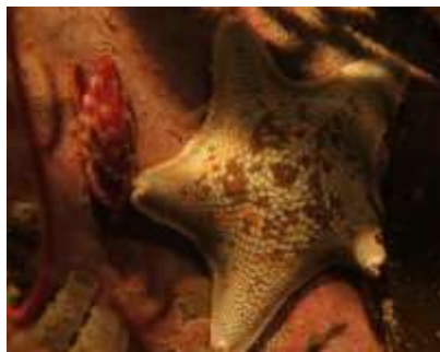
A Gastropod known as a Simnia