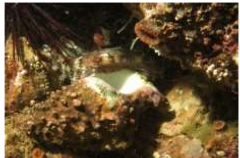
Two Spot Octopus in his lair