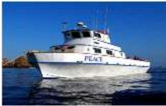
Peace Dive Boat

For more information please contact Glynn @ 310-266-2955 (Glynn now has a new address—31316 Via Colinas, Westlake Village)