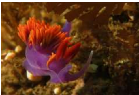
A Spanish Shawl nudibranch