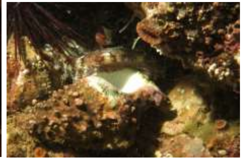
Two Spot Octopus in his lair