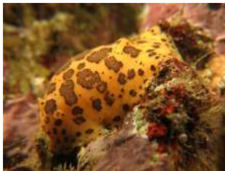
A Monterey Dorid, a nudibranch

at Santa Barbara Island