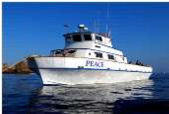
Peace Dive Boat

For more information please contact Glynn @ 310-266-2955