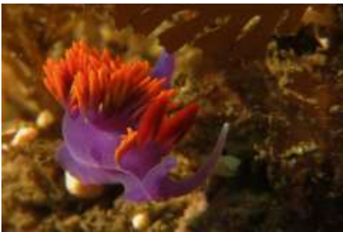
A Spanish Shawl nudibranch