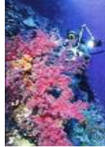
Red Sea Underwater Park