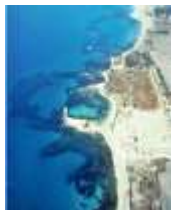
Petra, Jordan - Red Sea - Underwater Park