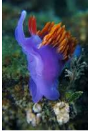
Spanish Shawl Nudibranch