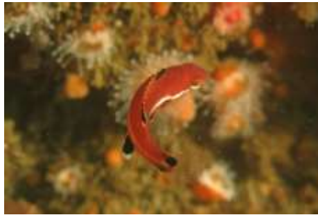
Infant Sheep head