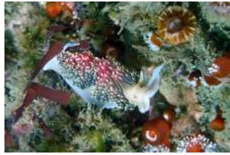
Hilton's Aeolid Nudibranch