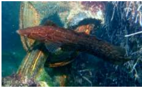
Kelp fish in front of the anchor chain of the Gosford