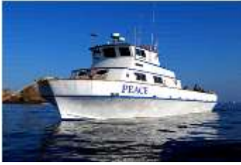
Peace Dive Boat