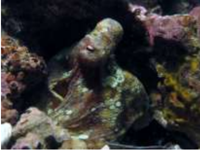
A Monkey Faced Prickle