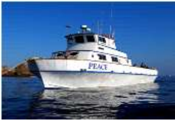
Peace Dive Boat